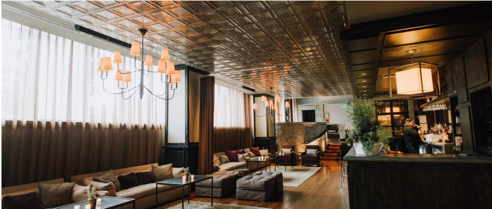
Hotel Indigo – Dallas Downtown