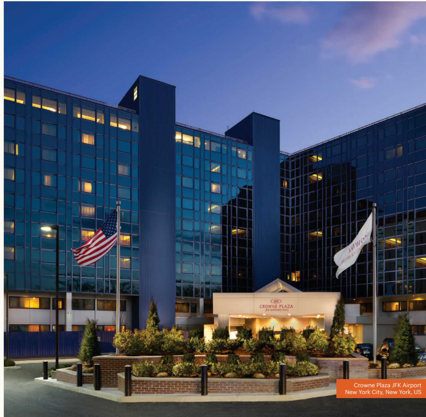
Crowne Plaza JFK Airport New York City, New York, US

Brand provenance invests brands with legitimate authority. This allows brands to emphasise their relevant differentiation and areas of expertise, while appealing to specific customer needs, helping to forge meaningful lifetime relationships.